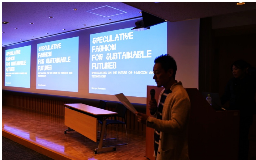
Conference "Social Fabrics". February 24 th , International Science Innovation Symposium Hall, Kyoto University.