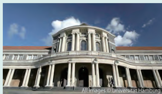
University of Hamburg

Furthermore, collaborating with people from different backgrounds in the two countries would let you build a wider network and experience Asian and European environments to get ready to be a real global leader.