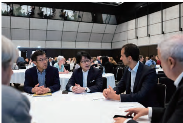
A scene from the EFMD Annual Conference