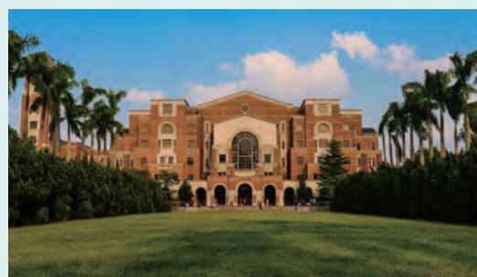
National Taiwan University

Being the top business school in Taiwan, NTU College of Management has been highly recognized internationally as well. At the NTU's vast campus, not only domestic students but also international students gather from all over the world, which enables you to study in an international environment while staying in Asia. Moreover, there will be many opportunities to connect with well-known companies, both domestic and foreign-affiliated – the best environment to learn global business based in Asia awaits you. By studying in the two universities, you will be able to learn from different perspectives and establish an international network. This program offers you a chance to broaden your career possibilities.